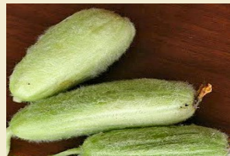
Fuzzy Italian Cucumber

Fuzzy White Italian Cucumber produces loads of small crisp, slightly-sweet greenish-white cucumbers with a fuzzy skin.